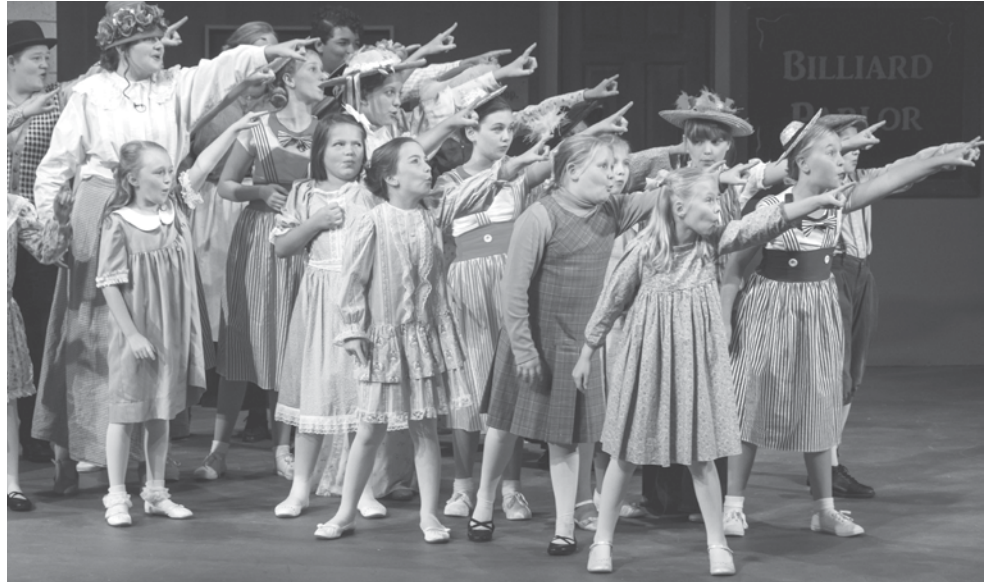
The cast from Music Man, Jr. waiting on the approach of the Wells Fargo Wagon. After a four-week course of instruction in singing, acting, and dancing, Center for Theatre Arts students presented the play for five audiences in July.

Participants receive a 4-week course of instruction in singing, acting, and dancing. A special show t-shirt is included.