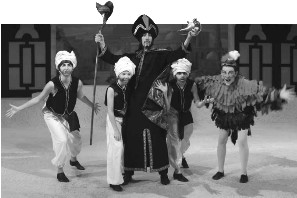
▲ CTA Summer Stage kids created a whole new world in June with their production of Disney's Aladdin Jr.

Center for Theatre Arts is the only academy between Topeka and Denver providing year-round education and opportunities in acting, dance, and vocal performance. We offer classes for students age four through senior citizens. Whether you're a beginner or a seasoned performer, we have a class level designed for you!