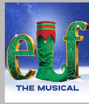
ELF July 13-17