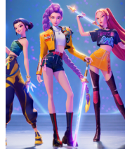
K-POP DEMON HUNTERS June 1-5