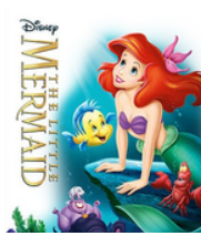
THE LITTLE MERMAID July 20-24