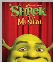
SHREK July 27-31