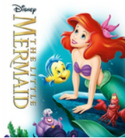
THE LITTLE MERMAID July 20-24